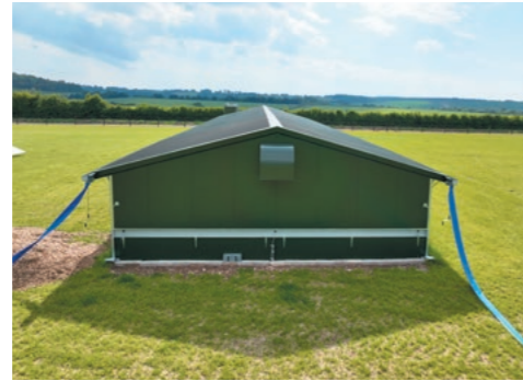
3 No. 3,000 Bird Free-Range Egg Laying Mobile Poultry Houses – Hampshire