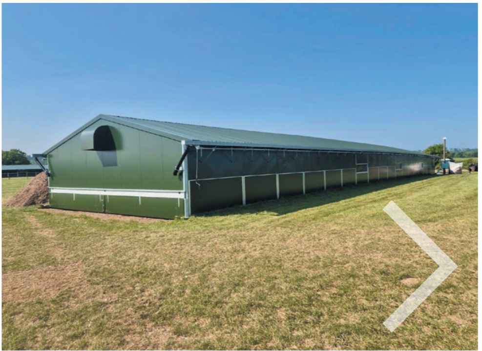
Each house measures 46m long (42.5m Bird Area + 3.5m Packing Area/Control Room) x 9m wide. The buildings have an overall height of 3.75m and are built on two galvanized steel channel skids. Each building has a large set of double doors in the Bird Area, one internal and one external personnel door, plus an additional egg pallet external door.