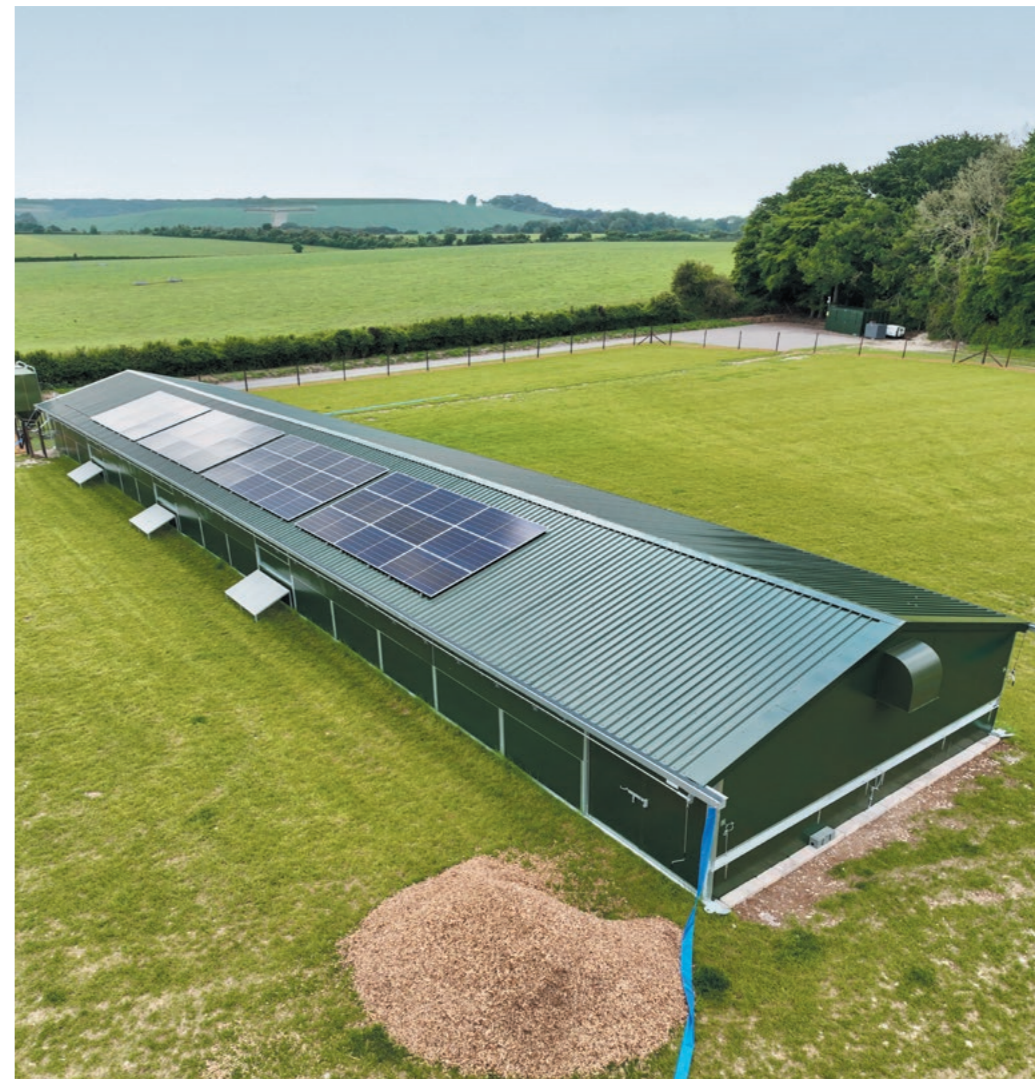
External cladding in Dark Green with a continuous 1.6mm thick galvanized steel gutter system. Internal lining in Goosewing Grey.